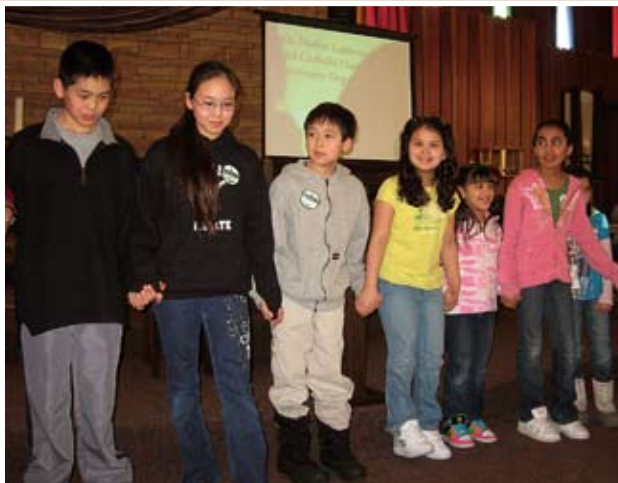
Children lead the prayer at the close of the Alaska Native Organizing meeting on education economic stimulus funds.