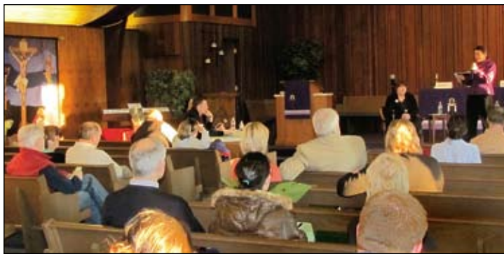
Candidates answer questions at the South Anchorage forum at Christ Our Savior Lutheran Church.