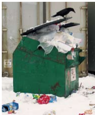
A raven picks through the garbage in one chronically overflowing dumpster on San Roberto Avenue.