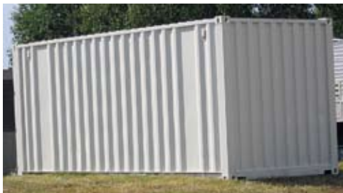
The Conex, bordering St. Anthony's property (top), covered in graffiti in early June and (bottom) repainted by Graffiti Busters in late June.

When “everyone is doing it and no one is taking any action to stop [graffiti] or address the damage” the message to children is that it is “ok to do.”