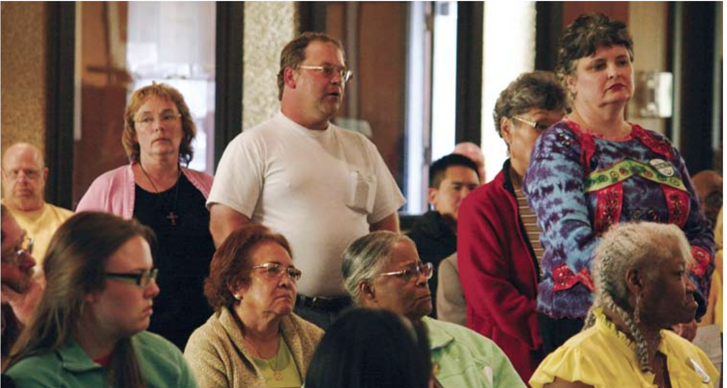
Congregation and community members wait to testify in St. Anthony Catholic Church.