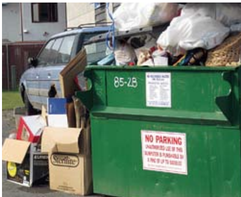
Evidence of blight in St. Anthony neighborhood: Water-filled potholes on San Roberto Avenue, a graffiti-covered fence on Klevin St., and an overfilled dumpster on San Roberto Avenue.